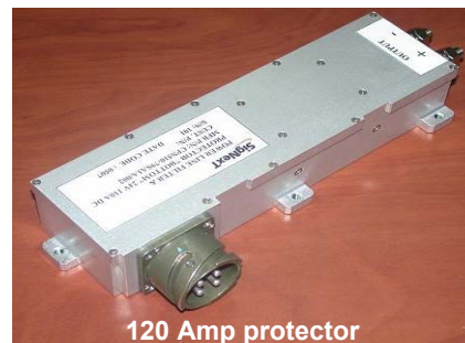
120 Amp protector